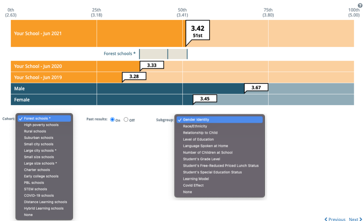
Figure 1. Sample YouthTruth Chart

School Rating and National Comparison: The orange bar at the top of the chart sets this school’s rating in a comparative context: compared to all schools of the same level (elementary, middle, high) that have participated in YouthTruth, this school’s average rating of 3.42 places it in the 51 st percentile – that is, the school received an average rating higher than that of 51 percent of other participating schools. At the top of the chart, the numerical values in parentheses beneath quartile labels indicate the average respondent rating associated with each quartile. In this sample chart, for example, the 25 th percentile is associated with an average family rating of 3.18.